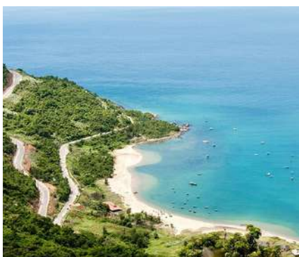
Son Tra Peninsula