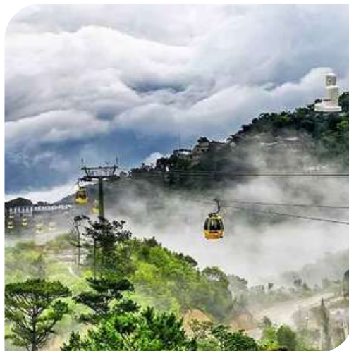
Ba Na Hills Cable Car