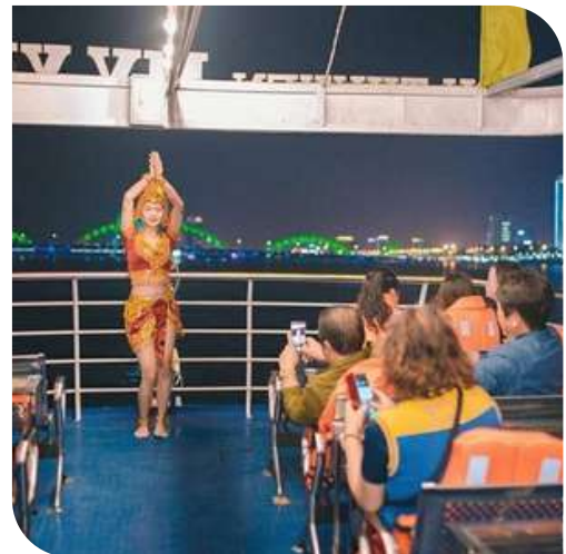
Han River Cruise Tour with Cham