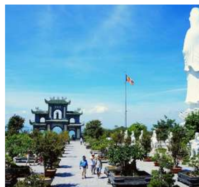
Linh Ung pagoda